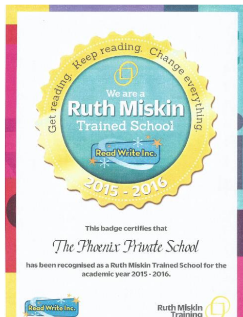
Ruth Miskin Badge

The Phoenix Private School is the first international school to receive the Ruth Miskin Training Badge for teaching Read Write with fidelity. It is currently a case study used by the Ruth Miskin team for international schools.